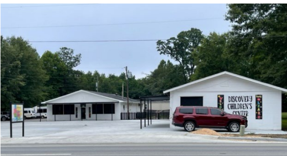
1036 N Main St, Hamburg, AR