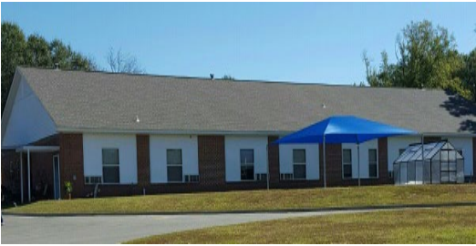
168 West College, Monticello, AR