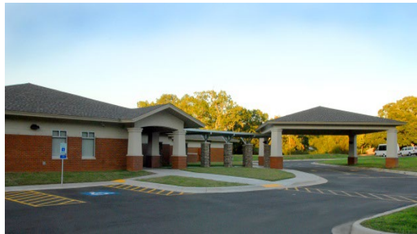
178 West College, Monticello, AR